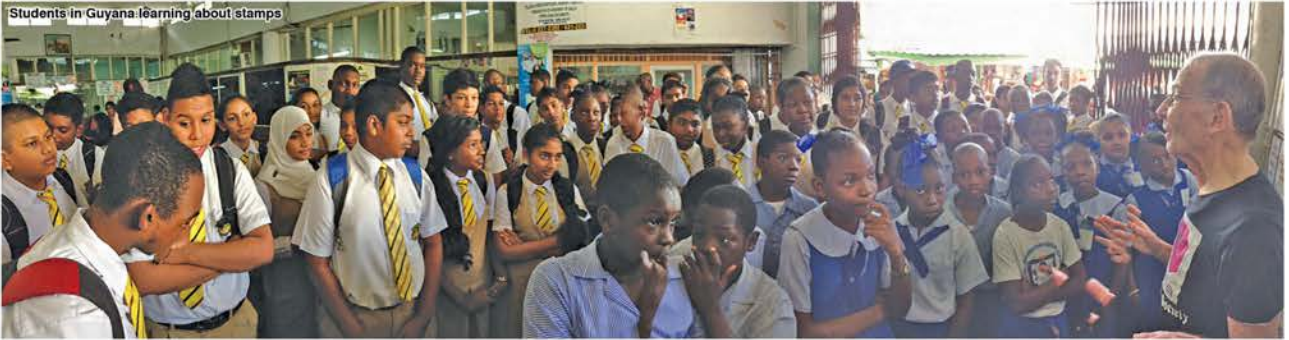
Students in Guyana learning about stamps