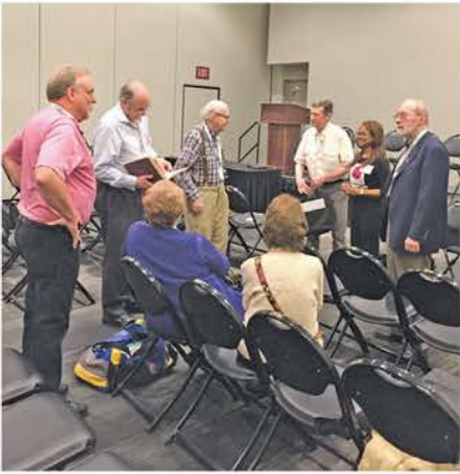
A few members of the Guyana Philatelic Society at a members meeting in New York

facilitates a collectors exchange or the buying and selling of stamps by its members. This includes all philatelic materials, envelopes, collections, books, to name just a few. The Society also offers philatelic advice from its experts and conduct appraisals of single stamps or collections of stamps from Guyana.